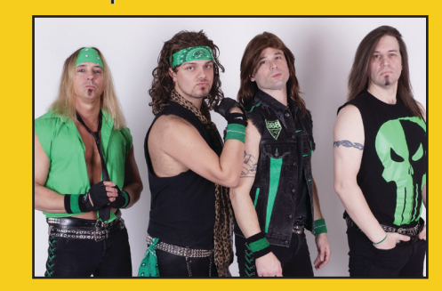
1988 BAND Sun., Sept. 4th • 8:30 pm